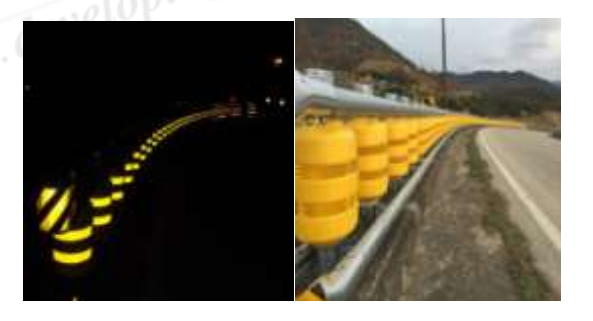
Fig.5 Rolling Barriers during Night and Day Time

The rotating barrels are made from Ethylene Vinyl Acetate (EVA), which is a copolymer of ethylene and vinyl acetate. It is an extremely elastic and transparent material. It is produced under high temperature and high pressure. It offers good gloss, low-temperature toughness, good chemical resistance, high friction coefficient, and resistance to UV radiation. Moreover, EVA has the advantage of being 100 % recyclable of all production waste which means that no waste is achieved producing from the material. This helps to exploit the resources using EVA in all productions. EVA is free of chlorides, heavy metals, phenols, latex and all toxics.Use of EVA barrels will make the entire rolling barrier system cost effective and environment friendly which is the need of the hour.