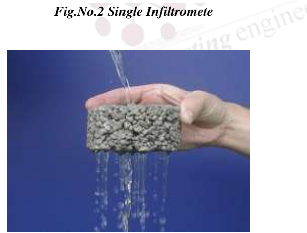
Fig.No.3 Free Draining of porous concrete.