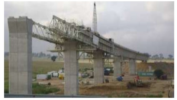
Figure 1 : File photo of viaduct showing launching girders resting on brackets attached to piers

High strength epoxy glue is then applied to the segment joints before post-tensioning takes place. The epoxy also seals the joint against water ingress from the outside. Once all the segments for a given span are in position on the girders, steel cables are threaded through ducts cast into the segments and which run the length of the span. These cables are then tensioned ("stressed") such that all the pre-cast segments are compressed together to form a continuous beam – one bridge span.