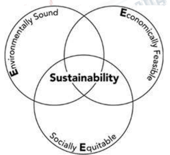
Figure 1, Basic frame of Sustainability (Brundtland)

"Cultural matters are integral parts of the lives we lead. If development can be seen as enhancement of our living standards, then efforts geared to development can hardly ignore the world of culture." (Sen, 2000)