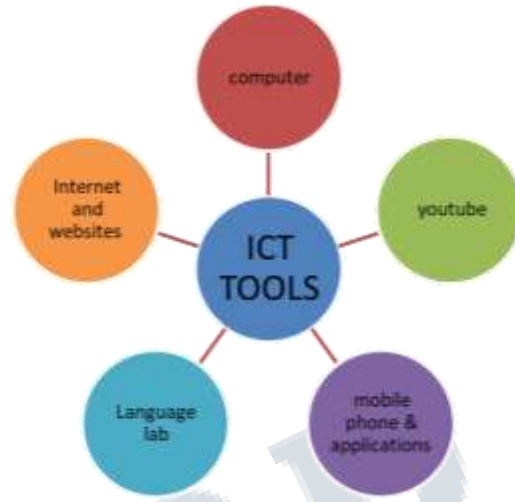
Fig 2: common types of ICT Tools

Its already mentioned that we are witnessing a real revaluation of technology. The integration of technology (information communication technology) in language acquisition will assist teachers and learners in their academic purposes. Using the tools of ICT in the classroom enables for giving more benefits in language teaching and learning. It motivates the students to do tasks that may otherwise avoid. The students in ICT enabled language learning class will do their activities by using a computer software platform without any hesitation. It will make repetitive tasks more exciting and will have content that could be multimedia formats. Multimedia use while learning English can help in creating a long-lasting impact on learners. The teacher's role will be changed into a coordinator instead of an instructor. What is being propagated is a self-paced independent learning methodology with the assistance of ICT enabled English language teaching. The following are the most common and vital tools used in English language teaching and have an essential role in improving the language skills for the learners:-