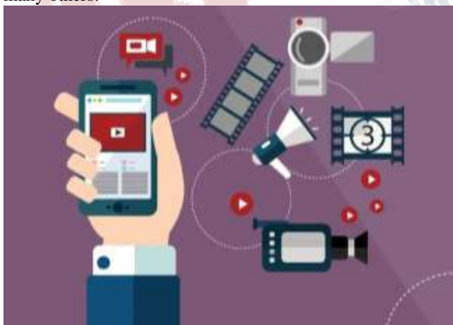
Fig 6: YouTube platform

YouTube is an online video sharing platform that permits the user to watch videos posted by other users and upload videos of their own. YouTube videos have been used in the English language classroom for different aims. It used to improve pronunciation, accent, vocabulary, listening, and others. Offering an actual example of everyday English used by people is one of the real benefits of using YouTube in English language teaching. Teachers can upload their lectures on their channels on YouTube to enable the learners to watch them. There are a lot of educational channels of English language such as learn American English, EF pod English, VOA learns English, BBC learns English, and many others.