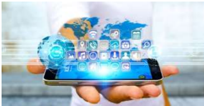
Fig 5: Mobile phone & applications

above, there is a variety of types of applications. Language learners can download any application he /she needs, for instance, dictionary apps, vocabulary apps, writing apps, etc. Dictionaries can be used by the learners to search new words to enrich their vocabulary.