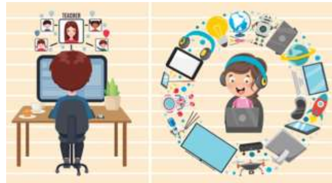
Fig 8: teaching and learning during the covid-19 pandemic

The ICT tools such as applications, websites, YouTube channels, webinars, and many others are all been used during the covid-19 pandemic. These tools enabled teachers to upload the teaching material on their university or school websites and Google classroom, whereas the others go for online teaching by using different applications such as zoom, Google meet, we meet, etc. During this crisis, the teachers start to organize webinars extensively, and students can join any webinar by one of the applications. The students exploit their time by attending webinars on different subjects.