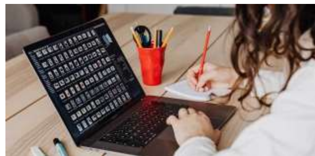
Fig 3: Computer-assisted language learning

This term had coined back in the 60s of the 20 th century. It has been revisited more comprehensively in the 90s. The frequent advances in deep learning and its applications help the computer-assisted language learning in growing more prominent than ever. The computer became one of the essential items in modern life human. The computer can be considered as a necessary tool for ICT. The computer is also used to enable most of the contemporary communication process. The main idea premise around computers being able to come up with a language learning environment to the learners without the attendance of the teachers. Preparing, storing, collecting, and preparing data for communication are things that can be done by the computer. Nowadays, handling both computer and English language is the most necessary skills to be acquired.