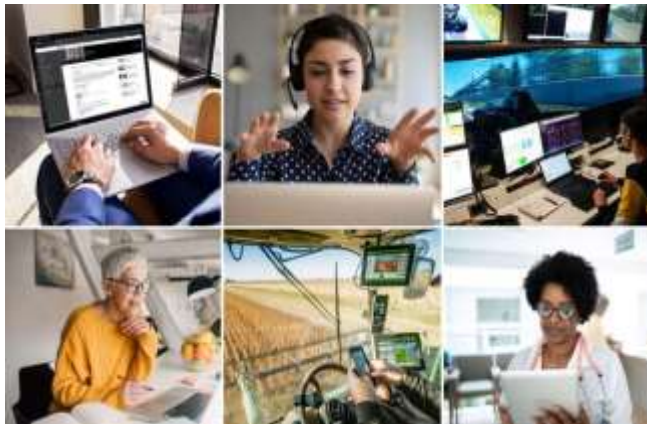
Fig 1: variety use of ICT tools

blog, and videoconferencing considered as equipment and services associated with technologies. These different tools can be divided into two types: web-based and non-web-based learning tools. Many of the mentioned tools have been applied to language teaching and learning. The present study is going to deal with the most common tools.