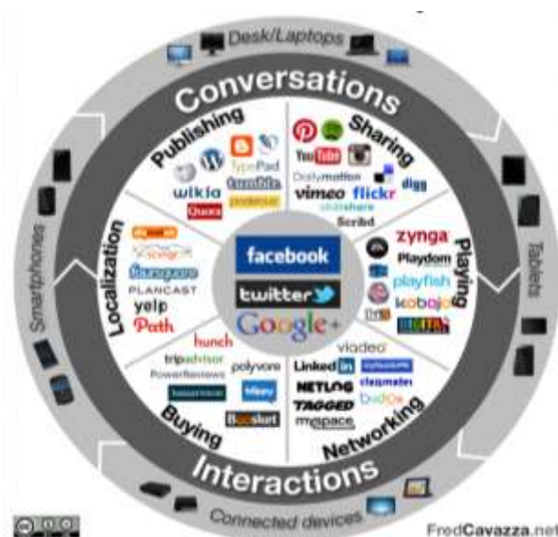
Fig 4: Internet and websites

The Internet offers an excellent opportunity to learn English rather than immersion in an English speaking environment. Nowadays, a noticeable relation between students with websites more than printed text. Students are frequently using the Internet and sites to share their information, ideas, and interaction purpose. The rapid spread of the Internet and the vital value of websites enable and encourage the students and teachers to use in the classroom and their personal life as well. It helps in saving time and energy. Students don't need to leave home or travel to have their classes. They can learn English lessons via the internet. Students can learn English whenever and wherever they want. The Internet helps both teachers and learners in searching for authentic material about English as well as courses, articles, and conferences. Students can send their assignments to the teacher via email, and the teacher can take an online exam. The facilities, such as online electronic whiteboards, worksheets, and notes, as well as webcam versions online, enable the students to have their missing lessons. Nowadays, there is a possibility to link the school in a network and work on projects together. Every educational institution has its website and uploads the study materials online.