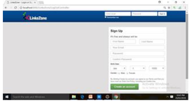
Fig1:-User Login by enter the email-id and password