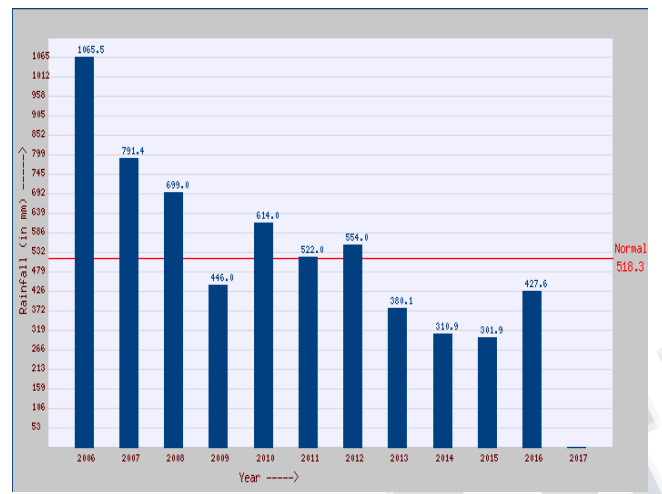
Fig1. Year wise rainfall in mm for Nimgavhan

The average annual rainfall in the village is 518.3 mm, though this is both erratic and uneven. It was found that from last four years this rainfall is less than the average annual rainfall as shown in the fig.1.