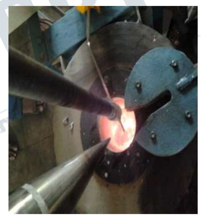
Fig.1. Molten LM6 in the furnace at 7500C

First of all 2% by weight of Graphite of grain size 20 \mu m is weighed and kept in polythene covers. Die casting method was selected for the easy preparation of the specimen. A metal mould die of cylindrical shape of dimensions \phi 40mm x 250mm is prepared from cast iron. The process was repeated for various percentage of graphite. The various steps involved in stir casting process are given below: