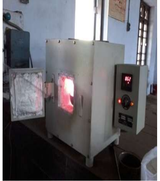
FIG2. Preheating of Graphite at 9000C