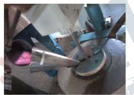
Fig .3. Adding preheated Graphite into molten LM6