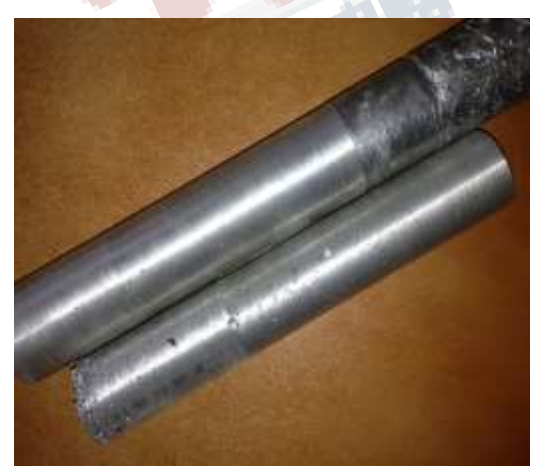
Fig.4 Finished casting after rough turning