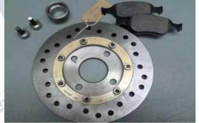
Fig 5.Prototype brake disc

Al<sub>2</sub>O<sub>3</sub> particle reinforcements have also been used.