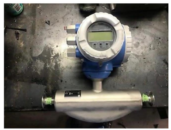
Figure 3.1 Overview of a Coriolis mass flow meter

Figure 3.1 and Figure 3.2 show the experimental setup of the Coriolis mass flow meter and the Flow-nozzle respectively.