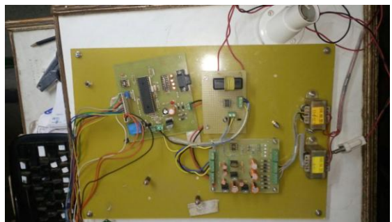
FIG. 2 Photograph of project

Energy (MNRE) Government of India, through state nodal agencies. Fig.2 shows actual photograph of project.