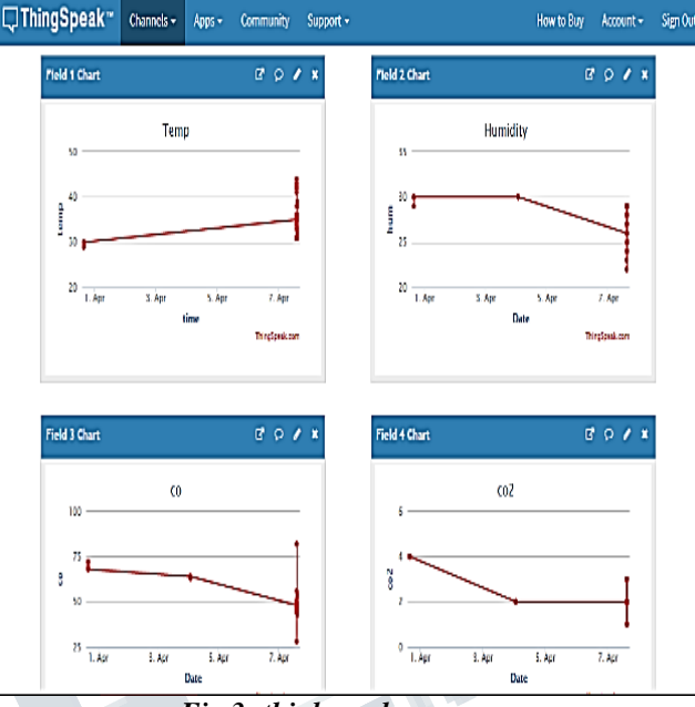
Fig 3: thinkspeak page.

Fig 4shows the login page of the IoT based environment monitoring system.