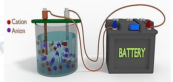
Figure 2 Anode cathode assembly

Anode used in this project is copper electrode immersed into CuSo4 solution. It is connected to positive terminal of battery. Cathode is copper base provided at bottom side of can. It is connected to negative terminal of battery. When battery supply is applied, it operates on Electrolysis principle.