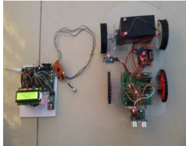
Figure 3: speech activated robot model

For the command set, for other users, the success is low relatively. The reason of that is the different pronunciation of the English words of the users. The figure 3 represent the Voice controlled robot model