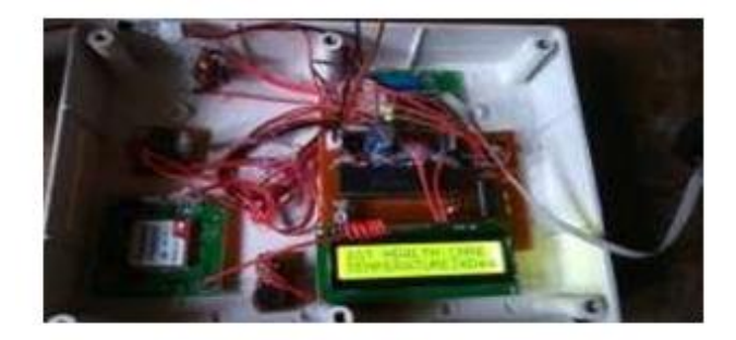
Figure 2: Designed system as with reference to block diagram proposed has shown in Figure 1.

The Designed system is as shown in the Figure5 (a).Following process goes on step by step when hardware is powered.