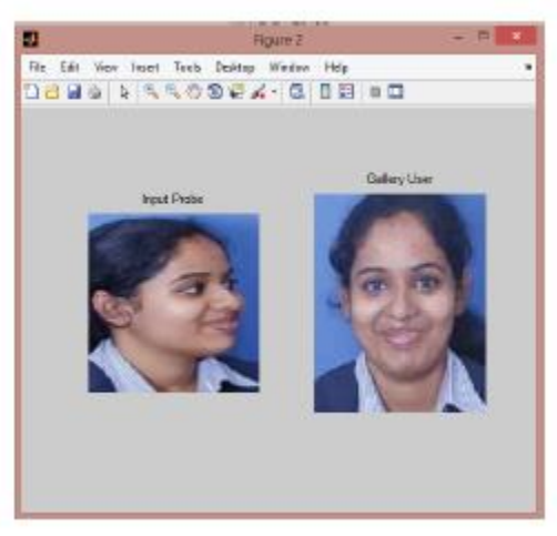
Fig.5. Identification of the image with varying pose and illumination to the corresponding gallery user