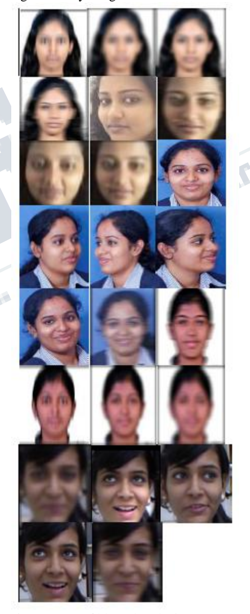
Fig.3. A part of blurred probe image set