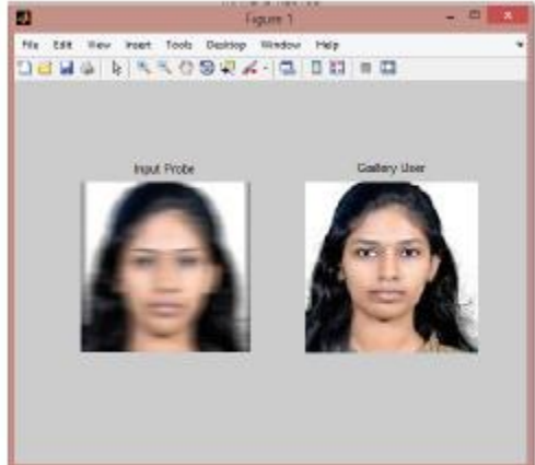
Fig.4. Identification of the blurred image with the corresponding gallery user