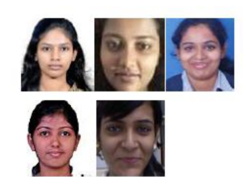
Fig.2. Gallery images

A gallery is obtained by storing the images of different persons. Using the set of above images with different blur, illumination and pose a probe set is created. A probe image is selected and by using hessian matrix, its blur is estimated. A threshold value is fixed for blur. If the value is greater than threshold then the estimated blur is applied to the entire gallery. The LBP features of the blurred gallery images and the given probe image is extracted and the distance between them is calculated. The gallery face which gives the minimum distance is recognised as the probe. Else the probe image is applied with gaussian and its DCT is calculated. The 3/4th of the probe image as well as all the gallery images are cropped. From the cropped probe image the LBP features and the HOG of LBP is found out. DCT and HOG of LBP forms the extracted feature set. The feature so obtained is compared with the RDF model of all the gallery images and thus the correct user is found out.