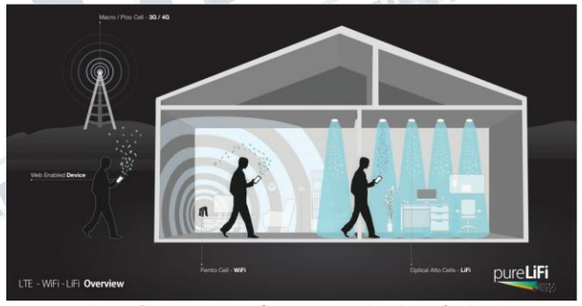
Fig 1 Comparison between Wi-Fi and Li-Fi

Over 4.3 billion people are without access to the internet, thus for the convenience of them we are using solar cell. By 2020, 50 billion devices such as car, water heater, etc., will be connected to internet. According to recent survey about 100 nuclear power plants are required for the power supply, thus in order to reduce it LEDs and solar panels are used as LED consumes very less amount of power. The main aim is to avoid network traffic or congestion and reduce the consumption of power supply.