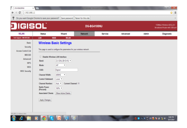
Fig.3 Wireless Basic Settings