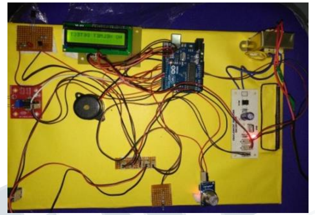
Fig. 3. No helmet detected

The helmet removal test was done using Ir sensors used in our project by using different sizes, shapes and different colors sensor given satisfactory and 100% results is obtained as shown in figure 3 and all various kinds of testing done during performance test of helmet sensor program done in Arduino controller done using digital pins run very well displayed helmet value on PC as well as send to receiver using zigbee communication 9600bits/sec to a range of nearly 10mts with line of sight and without line of sight at constant 5v.