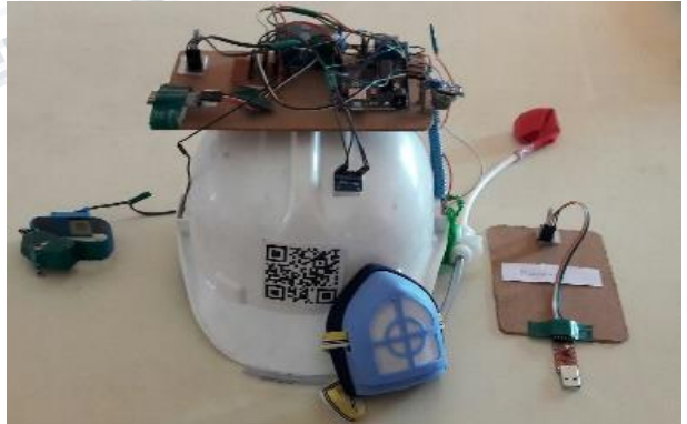
Fig. 4(a) Smart helment

Gas sensor in our project used is MQ-2 measures a wide range of gases like LPG, CO2, also alcohol this sensor has been tested under extreme condition of high and low chemical and dangerouspoisonous which are hazardous for human health. The sensors values are accurate when tested and proceeds and results are displayed on PC as shown in Fig:4(b), Fig:4(a) represents the design of this idea.