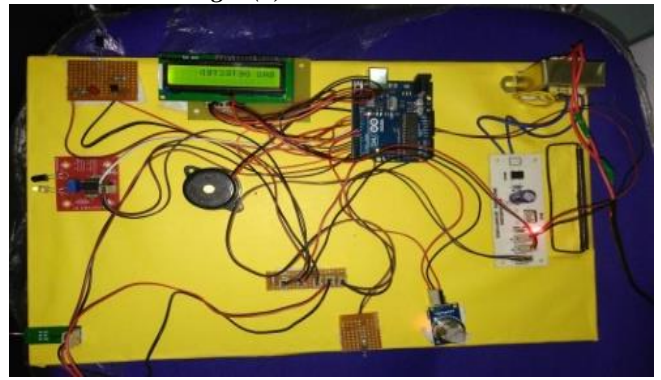
Fig. 4(b): Hazardous Gases are detected.