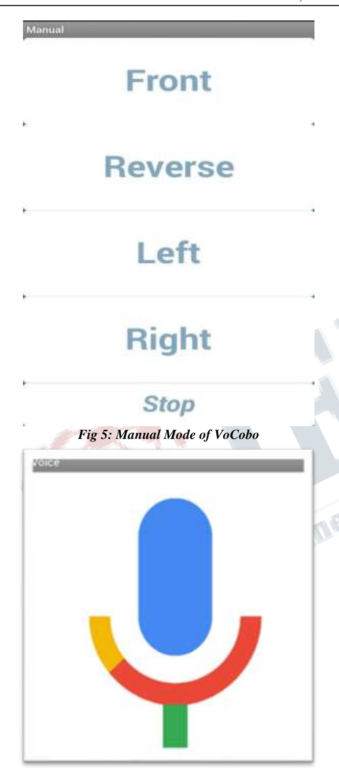
Fig 6: Voice mode of Vocobo app