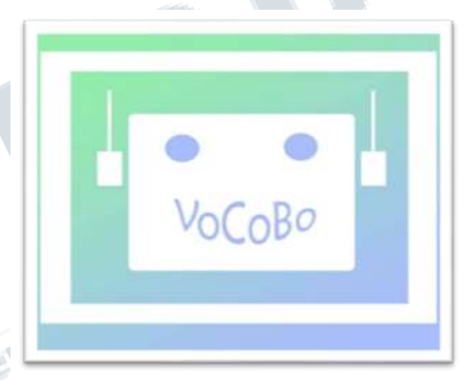
Fig 3: Logo of Vocobo software and Mobile app