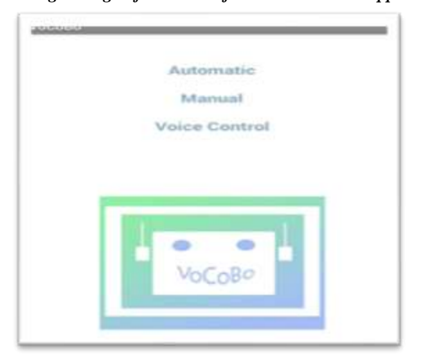
Fig 4: Display page of Vocobo app to android mobiles