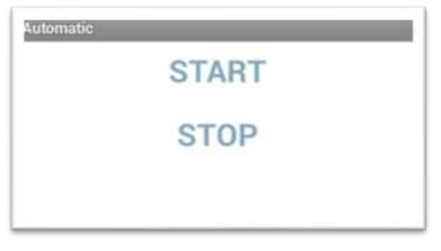
Fig7: Automatic Mode of Vocobo app