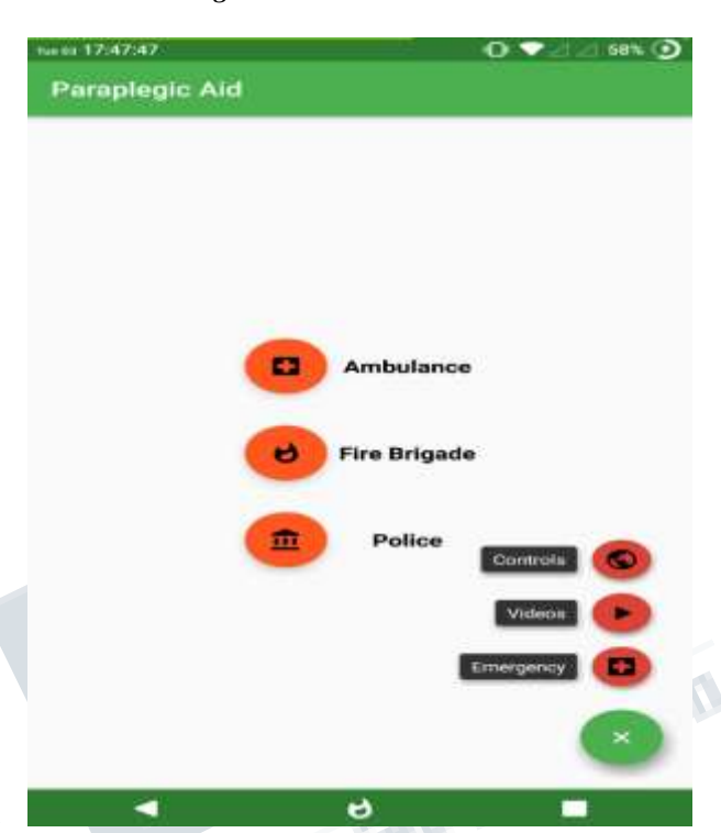
Figure 4: Home Page of the Paraplegic Aid App