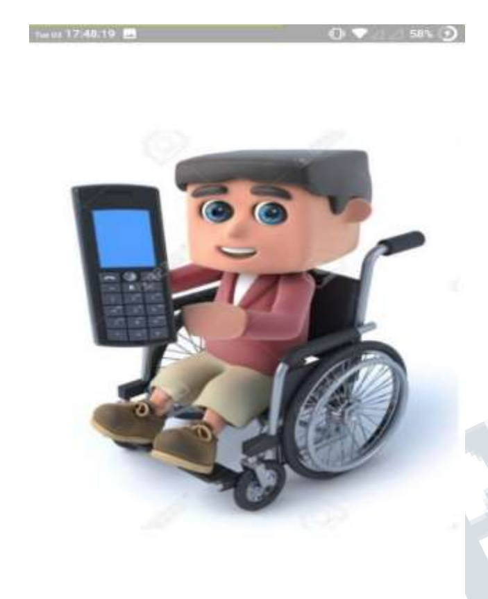
Figure 3: Icon of Paraplegic Aid app