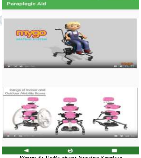
Figure 6: Vedio about Nursing Services