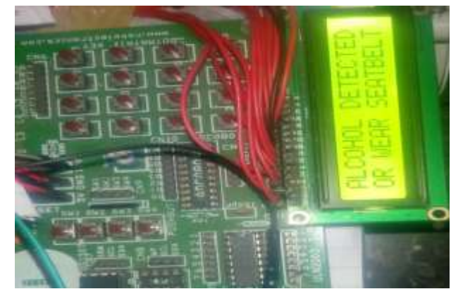
Fig.7 Display of Seat Belt Indication or Alcohol Detection