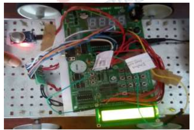
Fig. (b) Implementation Circuit