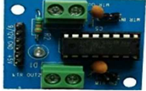
Fig. 5 Motor Driver (IC L293D)