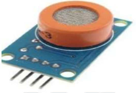
Fig. 2 Alcohol sensor (MQ3) C. Heartbeat Sensor:

gasoline. The sensitive material used for this sensor is SnO2, whose conductivity is lower in clean air. Its conductivity increases as the concentration of alcohol vapour gas increases. This module provides both digital and analog outputs as shown in the Fig.2.