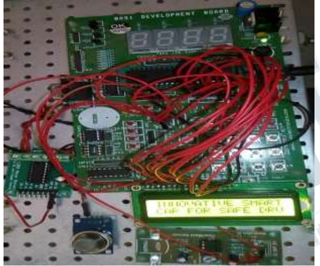
Fig.(a) Experimental Setup