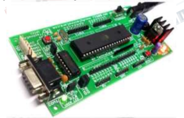
Fig. 1 8051 Development Board (AT89S52)

Microcontrollers are "embedded" inside some other device. They can control the features or actions of the product. Another name for a microcontroller is "embedded controller". Microcontrollers are dedicated to one task and run one specific program. The program is stored in ROM (Read-Only-Memory) and generally does not change. Microcontrollers are often low-power devices. A microcontroller has a dedicated input device and has a small LED or LCD display for output as shown in Fig.1. A microcontroller also takes input from the device it is controlling and controls the device by sending signals to different components in the device.