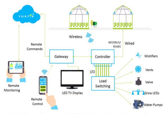
Fig. 1: A Proposed Framework for Blockchain based Smart Greenhouse Farming