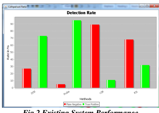
Fig 2 Existing System Performance