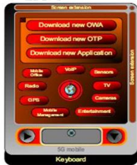
Fig. 3 5G mobile phone design