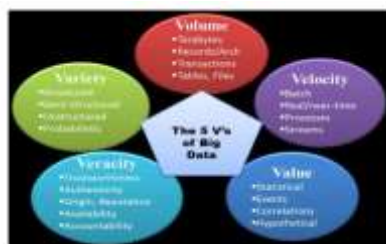
Figure 1: The 5Vs View at Big Data

(4) It has been recognized that data granules are considered rather than numbers for correspondence with clients in frameworks and stages.