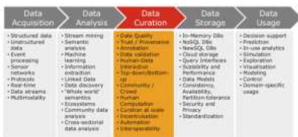
Figure 3: Roles of Fuzzy Set Techniques in Big Data Processing

So as to comprehend the jobs of techniques of fuzzy set effectively, it first review the normally recognized worldview of the big data processing such as data concentrated science. The focal issue of the worldview is data, rather than computation, and outcomes in intuition with information. Fig. 3 depicts chain of value creating within the sight of big data.