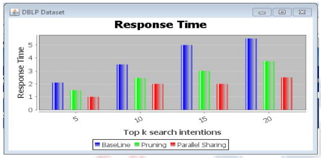
Figure 5. Average time cost of queries.

By analyzing anchor-based pruning, solution, limitation of baseline solution as more computational cost and time is overcome in the anchor-based solution. Anchor-based parallel sharing solution use by working the similarly by virtue of corresponding of diversification for search keyword and reduction in the perennial scanning of the similar list of nodes, which is a less time-consuming process and more execution speed..