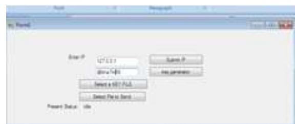
Fig 1. Data Encryption system

Ciphertext-policy attribute-based encryption (CP-ABE) encrypts a 64-bit block of plaintext to 64-bit block of ciphertext. It uses a 128-bit key. The algorithm consists of eight identical rounds and a "half" round final Transformation. There are 216 possible 16-bit blocks: ., Each operation with the set of possible 16-bit blocks is an algebraic group. Bitwise XOR is bitwise addition modulo 2,and addition modulo 216 is the usual group operation. Some spin must be put on the elements – the 16-bit blocks – to make sense of multiplication modulo 216 + 1, however. 0 is not an element of the multiplicative group.