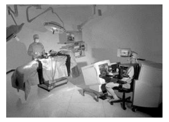
Figure 3: Zeus System Set Up