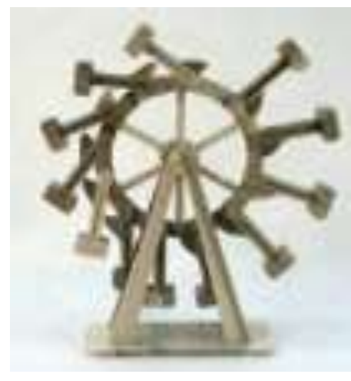
Figure 2: Device of Villiard De Honnecourt In 1253

energy is an ideal energy asset for tomorrow since it creates free energy with no sources of info. 'A down to earth manual with the expectation of complimentary energy sources', a course book wrote by Patrick J Kelly in the year 2002 contains different strategies for accomplishing free energy, two of them incredibly venerated; ShenHe Wang's Permanent Magnet Motor and Donald Lee Smith's attractive generator clearly clarifies the strategy to tackle attractive powers to change over it into electrical energy.