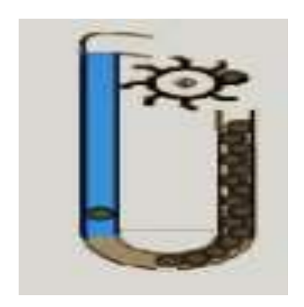
Figure 1: Perpetual Motion Machine Consisting of a Plumbing – Mechanic System

As an example: student of history Gaius Plinius Secundus (23 - 79 A.D.). In the e, here is a pipes - repairman system with imparting containers of various length as Fig.1, which contains two fluids with a significant contrast in thickness for example water and mercury. The globules that is destined to be moving neverendingly in the two cylinders, glide in the two fluids. Every globule that goes upwards due to the light power in the left cylinder falls onto the wheel, which turns in light of every globule's force, while subsequently drops into the right cylinder. There the expanded all out weight of the globules pushes the framed segment and along these lines another globule arrives at the base and afterward it ascends to the outside of the fluid in the left cylinder, etc. Regardless of whether this gadget isn't conceivable to work as a ceaseless motion machine, the genuine reason appears difficult to be found [4].