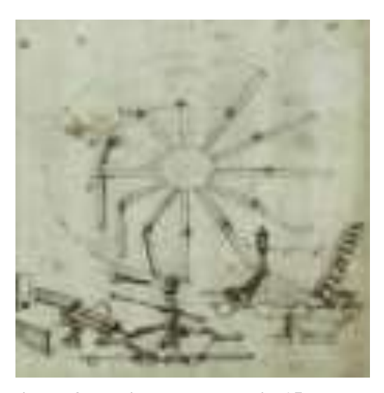
Figure 3: Devise By Taccola in 15thcentry