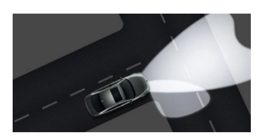
Fig. 1: Two ways of headlight beam control, Low and high beam.