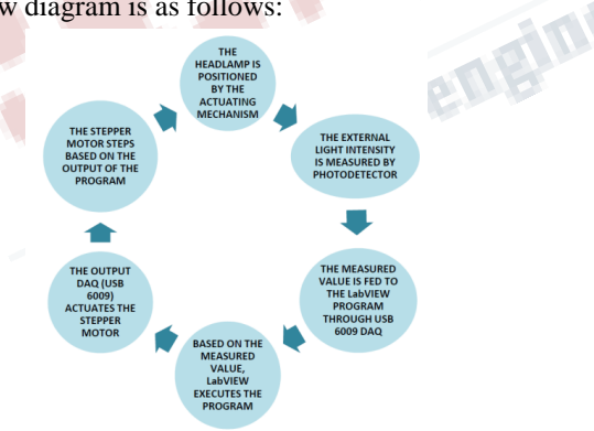
Fig.4. The Flow Diagram