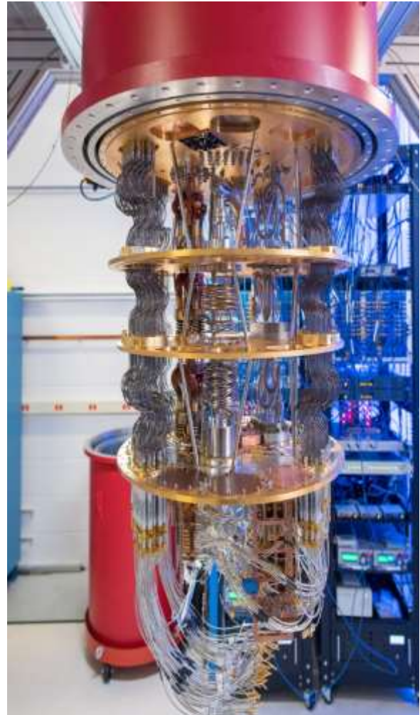
Figure 3: Quantum computing leaps

Another issue is equipment for quantum computers. Many Research Laboratory have built a basic quantum computer utilizing well known NMR innovation. Some different structures depend on particle trap and quantum electrodynamics (QED). These techniques have huge confinements. No one realizes what the design of future quantum computers equipment will be.