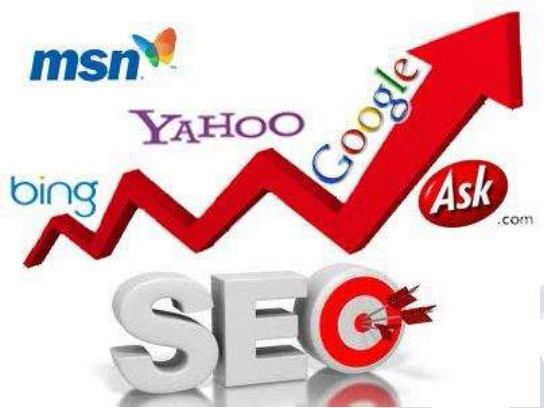
Figure 4: Search Engine Optimization

these websites rank better than the others then we must know that it is because of a great web marketing technique called Search Engine Optimization (SEO). Search engine optimization is a best practice that includes right strategies, powerful techniques and right tactics used to enhance the amount of users to a website by obtaining a high ranking placement in the search results page of a search engine (SERP) -- including top search engines like Google, Bing, Yahoo and others[3][5].