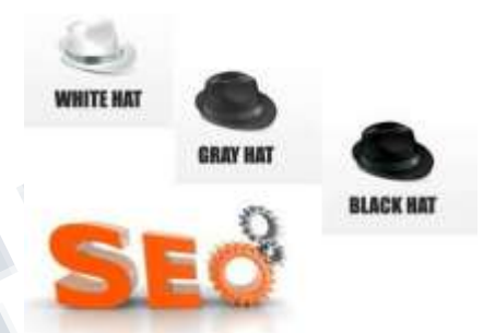
Figure 5: Search Engine Optimization Flavors

Flavors of Search Engine Optimization (SEO) We can divide search engine optimization technique into three flavors: