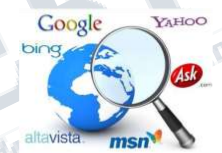
Figure 1: Different Types of Search Engines

In search engine industry Archie was the first search engine, which was used to search for FTP (File Transfer Protocol) files and in the other side the first text based search engine is known as Veronica. Because large search engines contain millions and sometimes billions of pages, many search engines are not only just searching the pages but also display the results depending upon their importance. This importance is commonly determined by using various algorithms. There are currently different types of search engines available like Google, Yahoo, Ask.com, Bing, Alta vista etc. these are displayed in Figure 1.