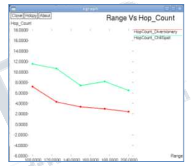
Fig 3 Xgraph Of Range Vs Hopcount

performance. At an optimal range value between the sensor nodes, the hop count decreases, and hence there will be lesser average delay. But when the range further increases from the optimum value, the lifetime of these nodes reduces as more transmit power is required. In our proposed system, when the range increases the hop counts involved are more when compared to the existing system. Hence there is more delay in the packet reaching the destination.