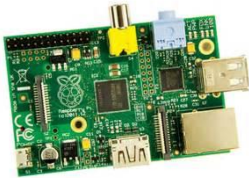
Raspberry pi –model b

The Raspberry Pi runs Linux based operating systems and there is a specialized version of Linux based kernel known as Raspian which can run almost all programs which are Linux compatible. Hence in this project we have used 'python' and 'wput', script written in python for motion detection and wput for storing the files on an external server