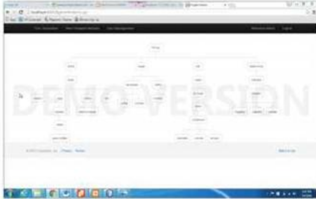
Figure 2. FP-Tree Generation