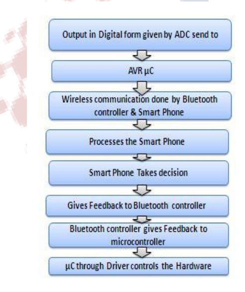
Fig c) Flowchart showing operation of AVR with smart phone.