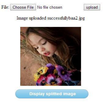
Fig3.3: upload a cover image

After completion of login process the user select the cover image to embedded the secure file and select the file. The selected cover image is displayed below Fig3,2.