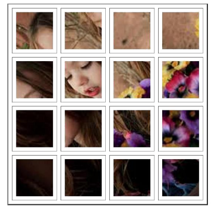
Fig3.4: Slices of cover image

Then click the button display splitted image to slices the 16 image slices.