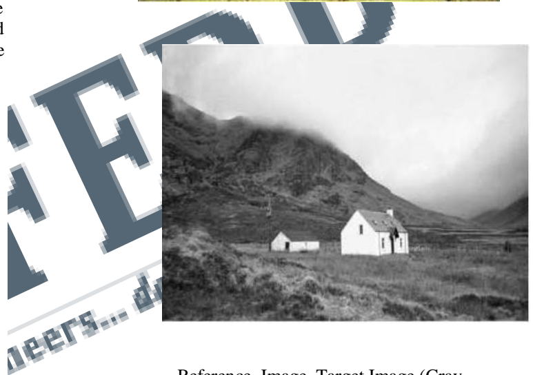
Reference Image Target Image (Gray Image)