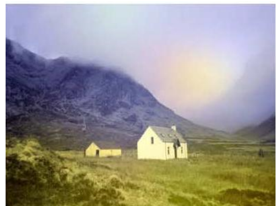
Color Image (Output image after Coloring)