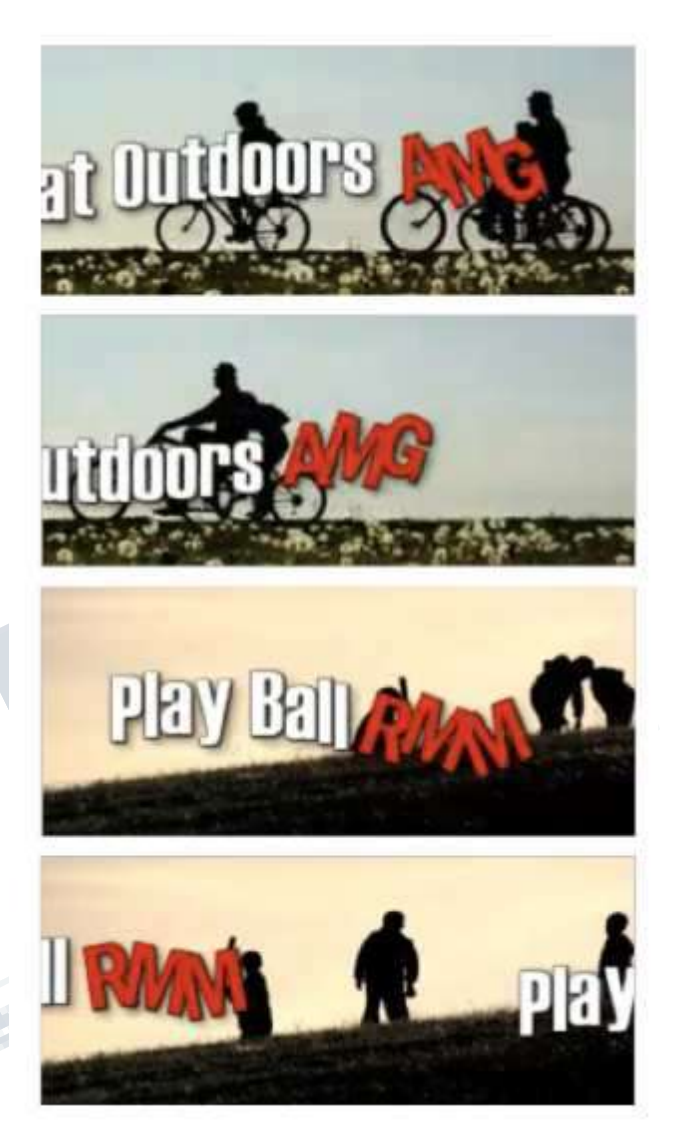
Fig. 3. Image with motion-based Captcha

The new proposed work can have the following characteristics: a changing background that can be made complex to enhance the security of CaRP schemes, multi-target discovery, changes in attributes like color, size, shape etc. The Fig.3 shows an animated Captcha with a moving background.