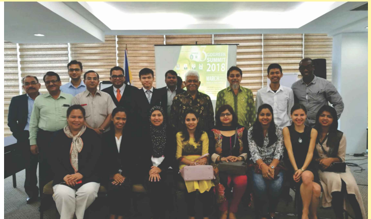
3 rd GoGreen Summit Manila, Philippines, 23 rd - 24 th March, 2018