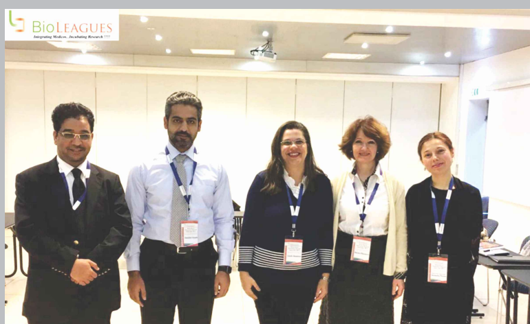
Bioleagues Global Summit On Phrmaceutical Science And Clinical Trials Denmark, 30 th Jan 1 st February 2017