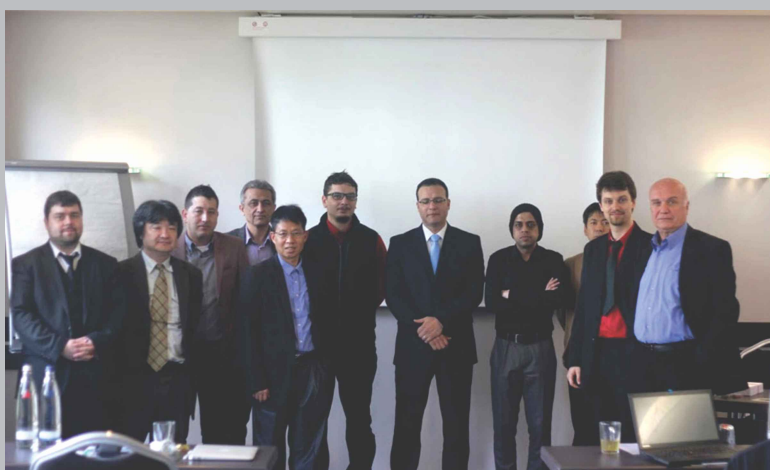
Bioleagues Nanotek Conferences Germany, 11 th - 13 th March 2017

Researchers Gallery, where we have unique and innovative permutation and combination of the perfection. Ranging from typical technology conferences to the advanced micro and subsets of latest popping up technology, we shoot our readers and listeners with all the latest innovated approached events.