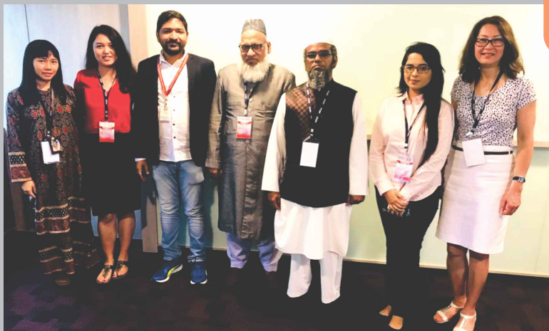
07 th World Conference on Applied Science Engineering and Technology WCASET 18 Malaysia, 05 th 06 th January 2018