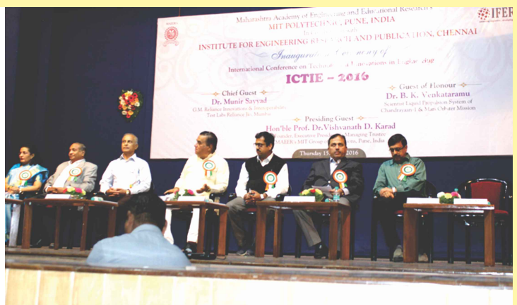
International Conference on Technological Innovations in Engineering ICTIE 2016 Pune, 15 th - 16 th Dec 2016