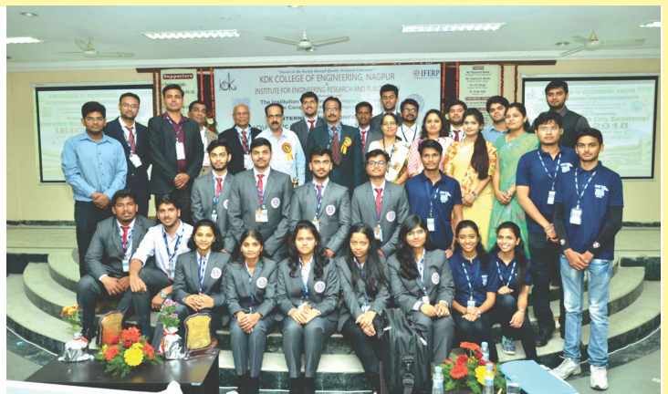
International Conference On Innovative Realms In Civil Engineering IC-IRICE-2018 Nagpur, 24 th - 25 th January 2018